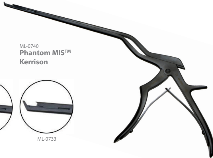
ML-0740 Phantom MIS™ Kerrison