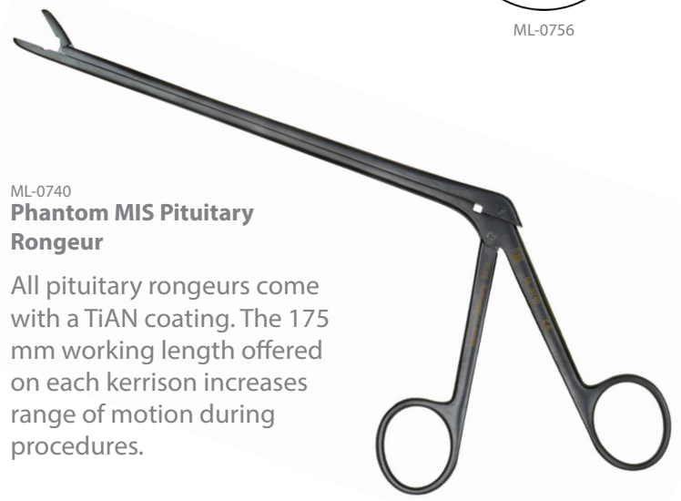
ML-0740 Phantom MIS Pituitary Rongeur

All pituitary rongeurs come with a TiAN coating. The 175 mm working length offered on each kerrison increases range of motion during procedures.