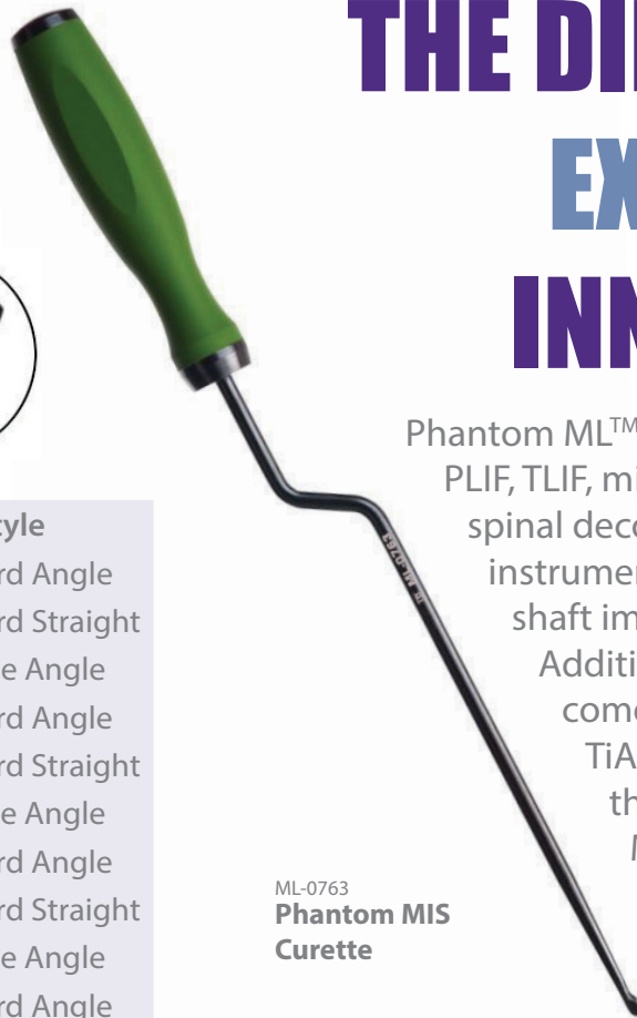
ML-0763 Phantom MIS Curette